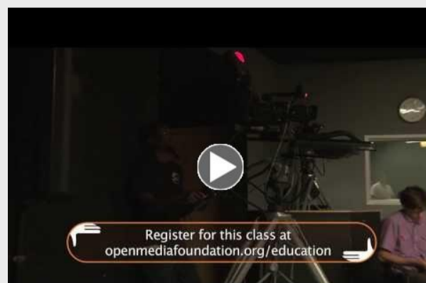
Intro to Studio Production