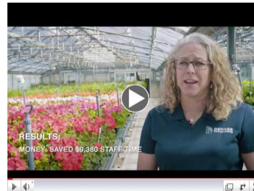
Peak Academy - Greenhouse

The OMF Video Production team recently completed a video for Peak Academy at the City and County of Denver. Peak Academy trains employees in innovations to improve government processes.