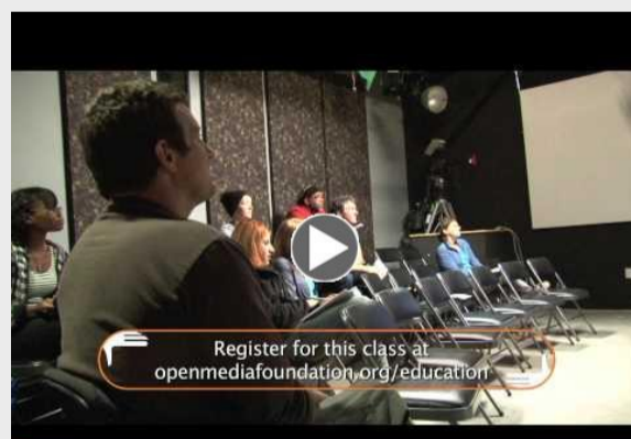
Field Production Workshop