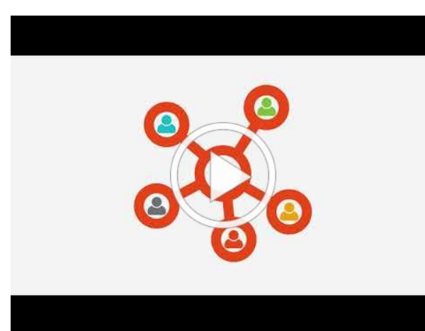
Civic Network: Doing Good, Better

To learn more about Civic Network, visit their website here .