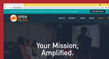
Open Media Foundation