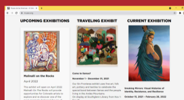
Museo de Las Americas

Our web development team has recently launched several new websites, including our very own Open Media! Our team also created spiderbots to crawl the web and scrape public meeting information for Documenters.org . Click them out!