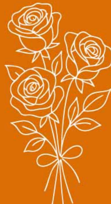
Feliz Día de la Madre