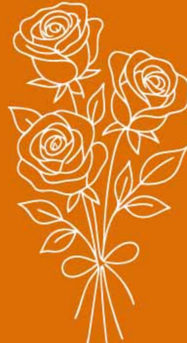
Feliz Día de la Madre