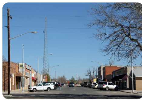
Main Street of Keenesburg

Watch Keenesburg Public Meetings Live and On Demand